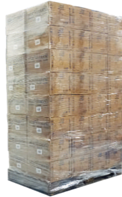
768 kg pallet (64 boxes x 12kg)