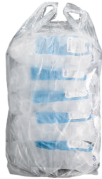
10 kg pack (5 bags x 2kg)