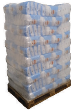
800 kg pallet (80 bags x 10kg)