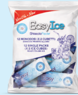
12 single-dose bag