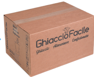
12 kg box (6 bags x 2kg)