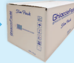
12 kg box 16 bags