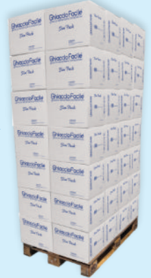
768 kg pallet