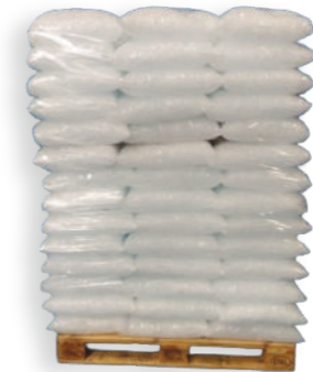
840kg pallet (84 ice bags x 10kg)