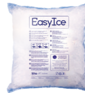
ice bag 10kg crushed ice